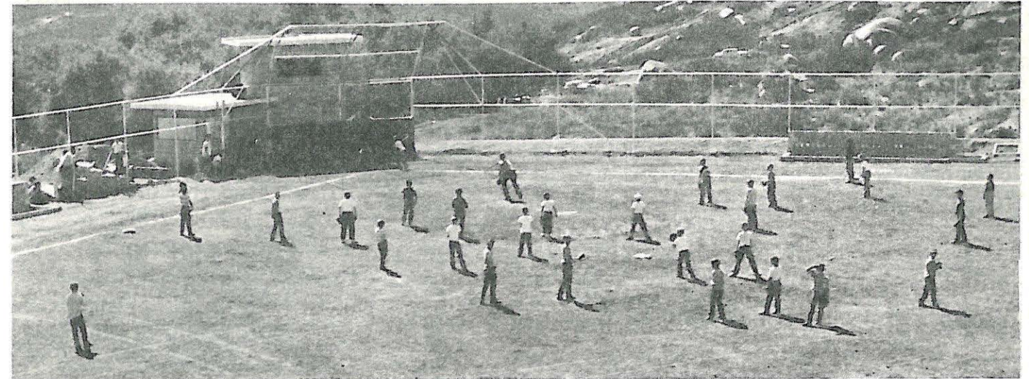
ALPINE BOYS ON THE IMPROVED BALL FIELD